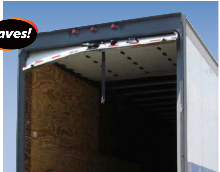
Typical bottom panel damage.